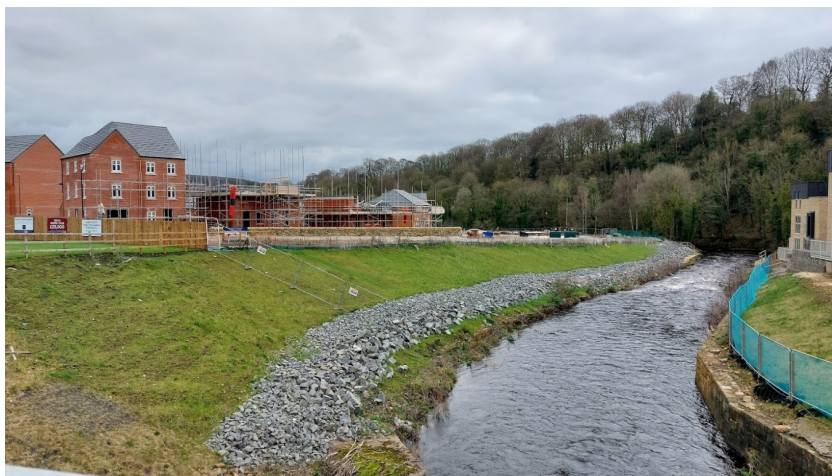
Emerging Trail and riverside park at Oughtibridge Valley

At Oughtibridge Valley (formerly Oughtibridge Paper Mill) house building has been accompanied by construction of most of the 0.75 km stretch of the Trail within the estate required by planning. Meanwhile we are delighted that design and costing of the long-awaited bridge and cycle footway over the Don to Forge Lane and the village, using a £750k developer contribution, is now finally progressing and council transport planners are cautiously optimistic that any shortfall in funding resulting from inflation can be met from other sources in the coming twelve months subject to further consultation on the details.