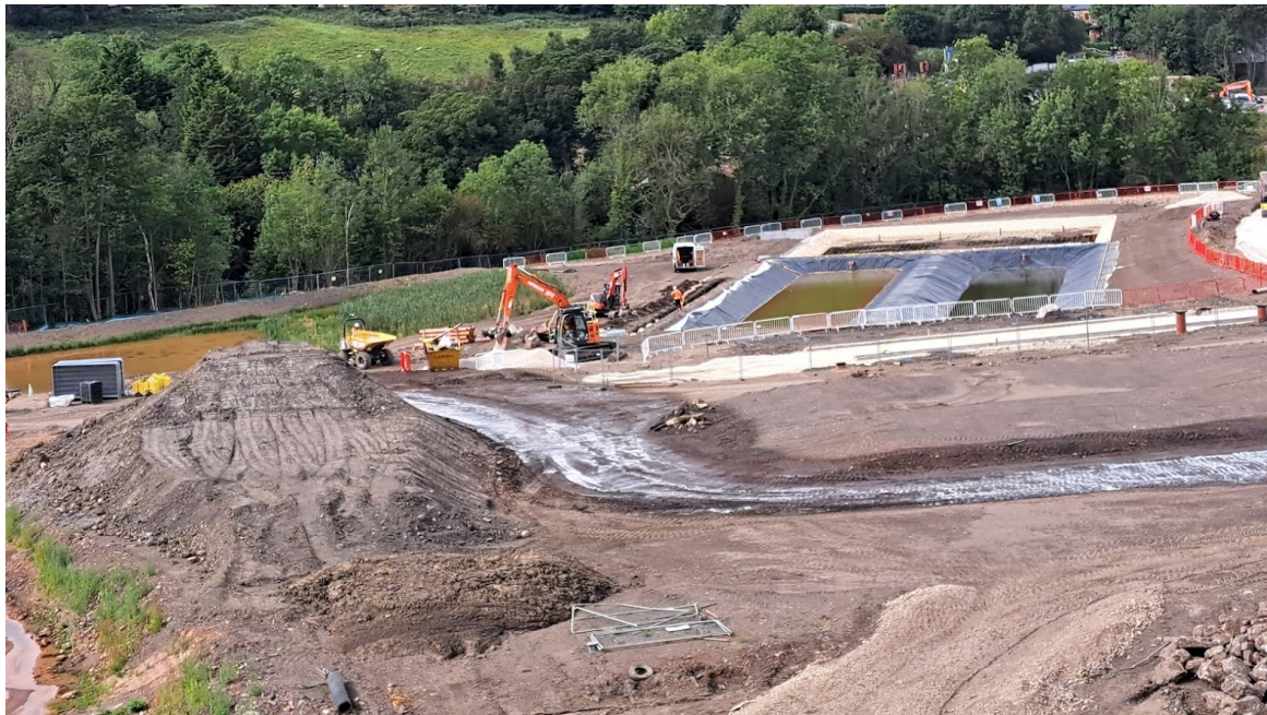
Bloor site August 2023 with new reedbeds

At the huge former brickworks site at Deepcar, Bloor Homes appear to have almost completed reclamation of the site. This includes new reedbeds to deal with the minewater, and the retaining walls for the 1km new riverside trail are under construction.