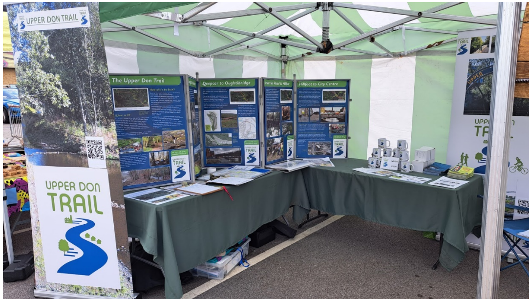
Our stall at Stocksbridge Fox Valley Market