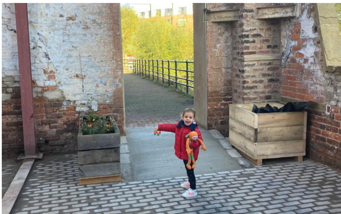
'The knock-through' - Little Kelham

The year 2023 saw some significant progress but also some major setbacks. However, the progress is solid and permanent, and the setbacks can we believe be recovered from. Overall extensions to the trail by developers through the planning process are continuing apace while awareness of and interest in the Upper Don Trail continue to grow. The new year 2024 offers some new opportunities which with the help of supporters and partners we can seize. The onus is really on public authorities to recognise this and take advantage of the momentum and offers of help.